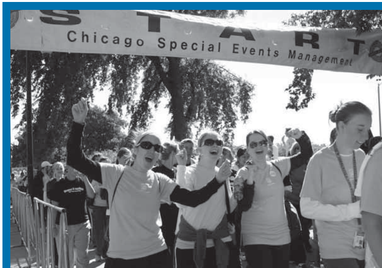
AIDS RUN & WALK DRAWS THOUSANDS TO LAKE FRONT

The law goes into effect June 1, 2008. To learn more about the bill, visit aidschicago.org/advocacy/news_6_27_07.php