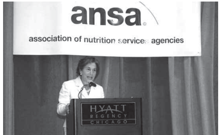
CONGRESSWOMAN JAN SCHAKOWSKY OF ILLINOIS ADDRESSES ANSA CONFERENCE ATTENDEES ABOUT THE CRITICAL ROLE FOOD STAMPS PLAY IN INCREASING LOW-INCOME AMERICANS' ACCESS TO NUTRITIOUS FOODS. REP. SCHAKOWSKY WAS ONE OF FOUR MEMBERS OF CONGRESS TO PARTICIPATE IN THE FOOD STAMP CHALLENGE THIS SUMMER.

The Food and Nutrition Advocacy Partnership, a coalition convened by the AIDS Foundation of Chicago (AFC) and funded by the Altria Group, Inc., has been working to improve the processing of food stamp applications for Supplemental Security Income (SSI) recipients. Although SSI beneficiaries are automatically eligible for food stamps, many have not been receiving the food assistance they need. Because many SSI beneficiaries are elderly, chronically ill, and/or disabled, they are in great need of access to nutritious food to manage their health.