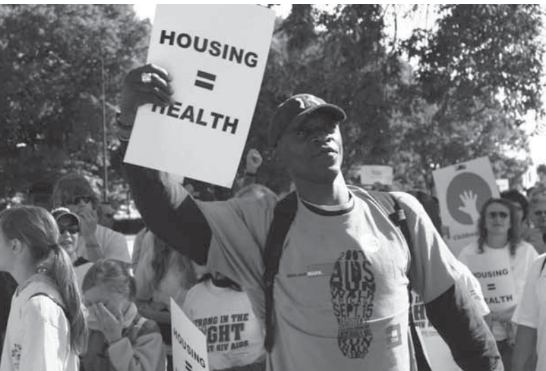
AN ADVOCATE AT THE RUN & WALK HOLDS A RALLY SIGN THAT CALLS FOR INCREASED FUNDING FOR AIDS HOUSING. TO LEARN MORE ABOUT THE CONNECTION BETWEEN HIV/AIDS AND HOUSING, VISIT AIDSCHICAGO.ORG/ADVOCACY/CITY_FUNDING.PHP

On September 15, a record-setting crowd of more than 7,000 AIDS advocates descended on Grant Park to run, walk, and raise funds in support of HIV/AIDS services. The event garnered an estimated $400,000 for AIDS organizations across the Chicago metro area, thanks in large part to the growing success of the CommunityDirect fundraising program. More than 67 HIV/AIDS community groups participated in CommunityDirect, which allows agencies that form teams to keep 100% of the funds they raise for the event. A total of 230 teams participated – the largest number in the event's history.