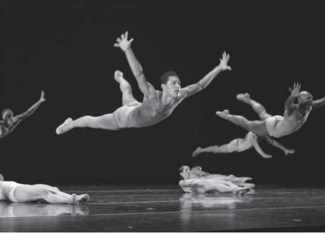
DANCERS WITH GIORDANO JAZZ DANCE CHICAGO TAKE FLIGHT.

more than $3 million, showcased 16 of Chicago's top professional dance companies, established a fund that provides assistance to dancers living with HIV/AIDS, and helped raise money for eight of Chicago's leading AIDS organizations.